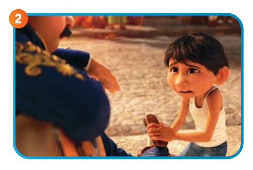
He likes / doesn't like cleaning shoes because it's difficult / boring.