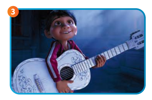
He likes / doesn't like learning an instrument because it's easy / exciting.

C Look, read and write. Then ask a friend.