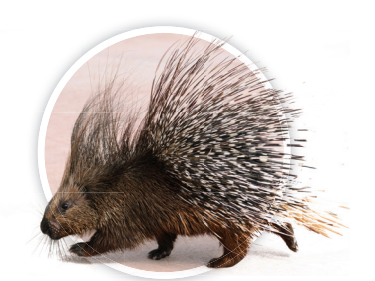
_ ___ cup ___ n ___

What can you see in the photos in 1? Unscramble the letters.