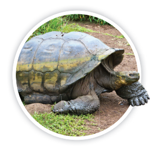
2 ___ u ___ t ___ e